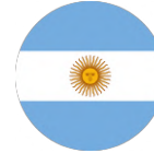
Universidad Siglo 21, BRAC University, Bangladesh Argentina