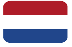
Windesheim University of Applied Sciences, the Netherlands