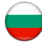
VUZF University, Bulgaria