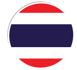
King Mongkut's Institute of Technology Ladkrabang, Thailand